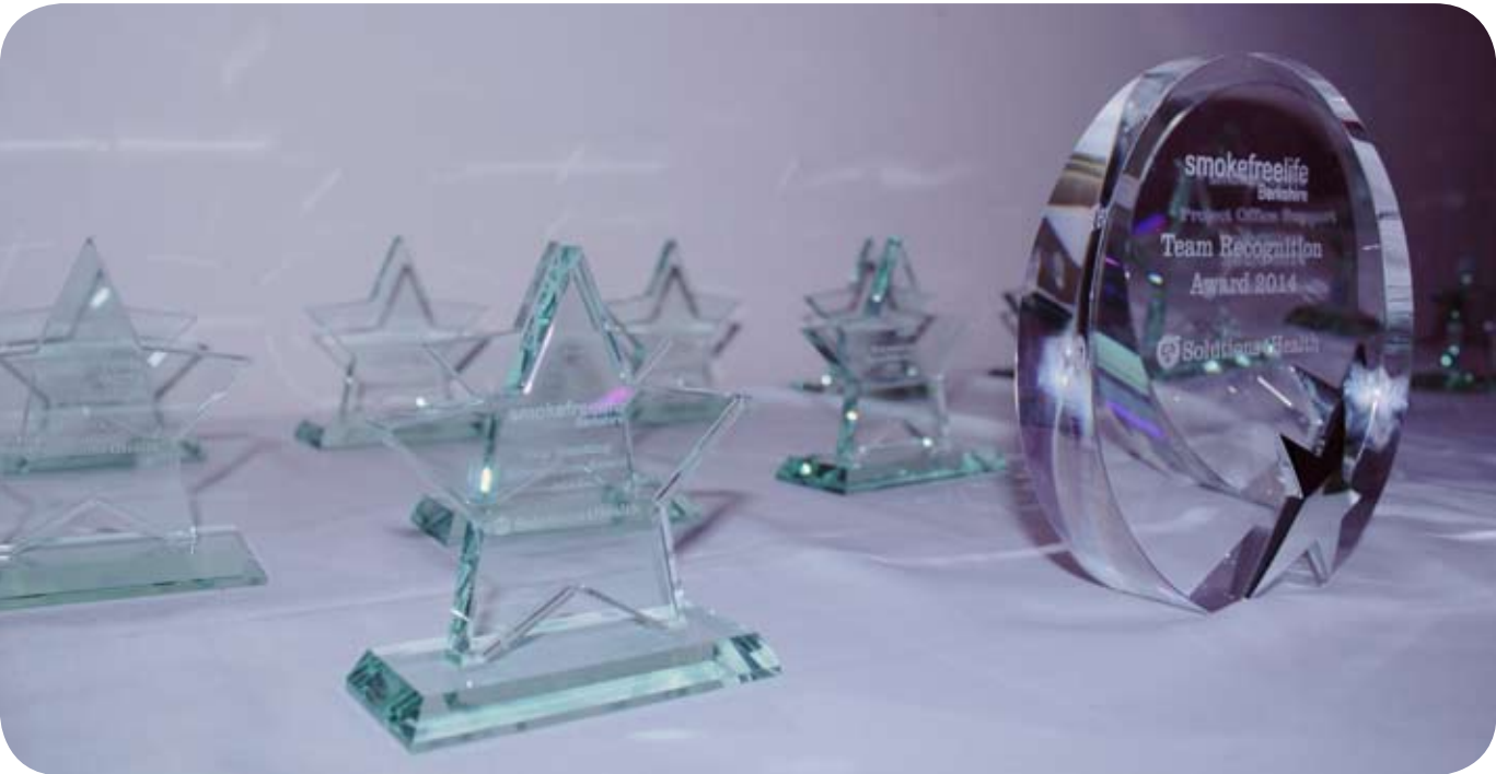
2013 was a successful year for Smokefreelife Berkshire and they hope to go above and beyond their targets this year to help as many people to lead a Smokefree life...

Smokefreelife Berkshire's collaboration with local partnerships which includes the Royal Berkshire Fire Service, GP surgeries, Pharmacies, Public Health, Acute Trusts, the Midwifery Service and the Mental Health Service has proven to be effective. This is reflected in the high quality delivery of services and successful results achieved throughout the county. Smokefreelife Berkshire's success is attributed to the hard work of the entire Berkshire team and the purpose of this event was to reward them for their contributions.