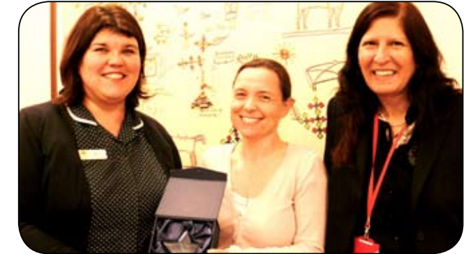
Lambourne Surgery in West Berkshire Winners of Smokefreelife Berkshire GP Recognition Award