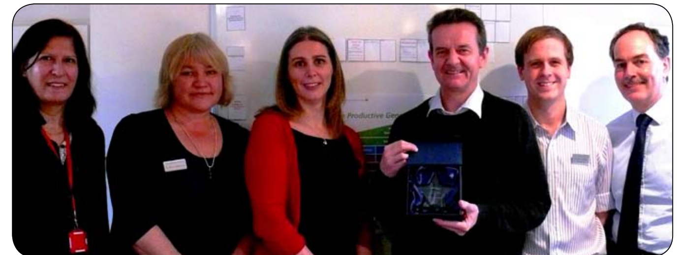
Proudly displaying their Smokefreelife Berkshire GP Recognition Award