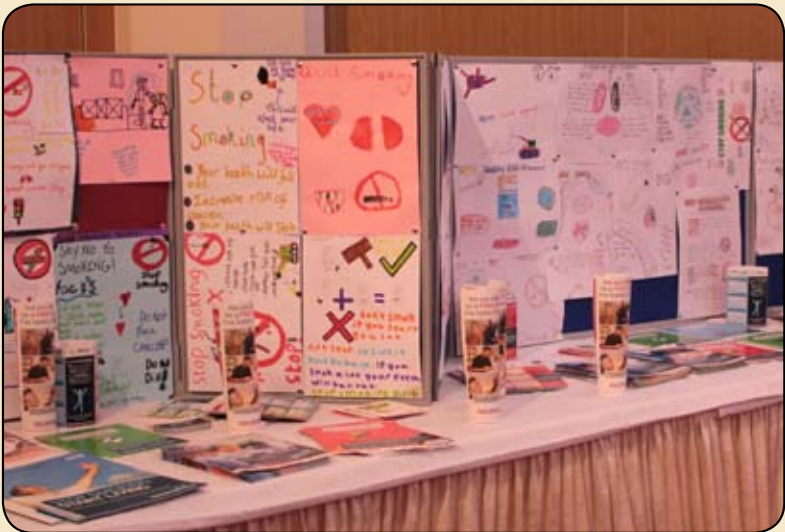
Posters from the Children's Video Competition... We received hundreds of entries from schools across Berkshire