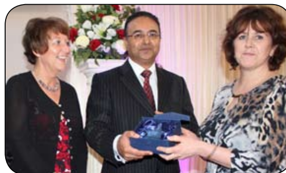
Woosehill Surgery in Wokingham, Winners of Smokefreelife Berkshire GP Recognition Award